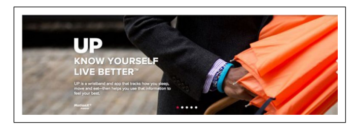
Figure 2. Jawbone UP: 'Know Yourself, Live Better'.

a traditional weight scale, one simply steps on and a number appears. There is a private data relation between the scale and the person, and it goes no further unless the data are consciously shared with others. The user gets to make a choice about whether they share the data from the domestic scale, and with whom. For self-tracking devices, data are mediated by a smartphone app or online interface, and are held firstly by the wearables company, along with other personal data such as name, age and gender. The user never sees how their data are aggregated, analyzed, sold or repurposed, nor do they get to make active decisions about how the data are used.