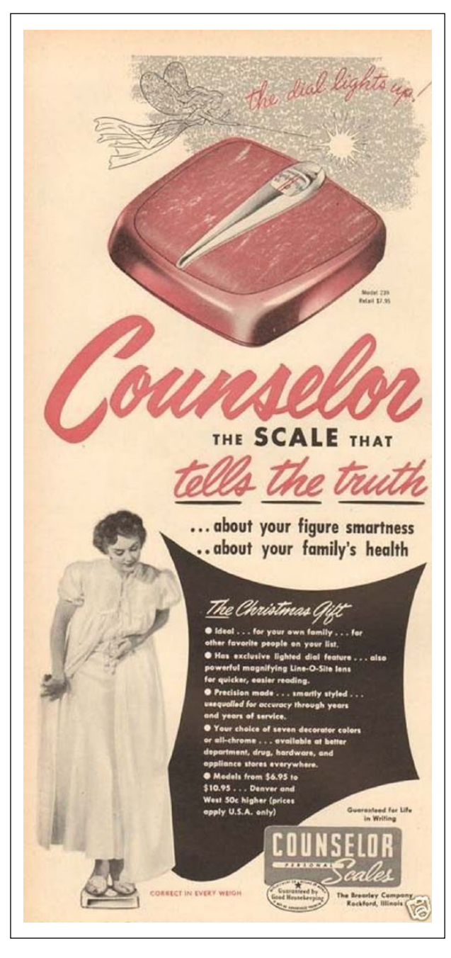
Figure 6. A 1953 ad for the Counselor bathroom scale.