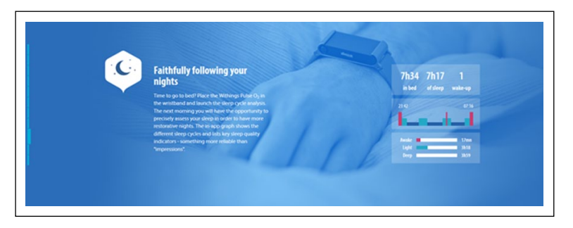
Figure 5. Image from the features description on the Withings Pulse webpage.

Figure for Christmas', and features a slim, well-dressed woman with a carefree smile and her left hand gesturing toward the scales that, presumably, she has to thank for her figure (Figure 7). The determinist implication of the ad is that the mere purchase of a scale produces a desirable figure. Constant consultation with one's own data generates the desired outcome of a thinner body. Measurement becomes the substitute for diet and exercise, transforming the body through a daily interaction with data about the body.