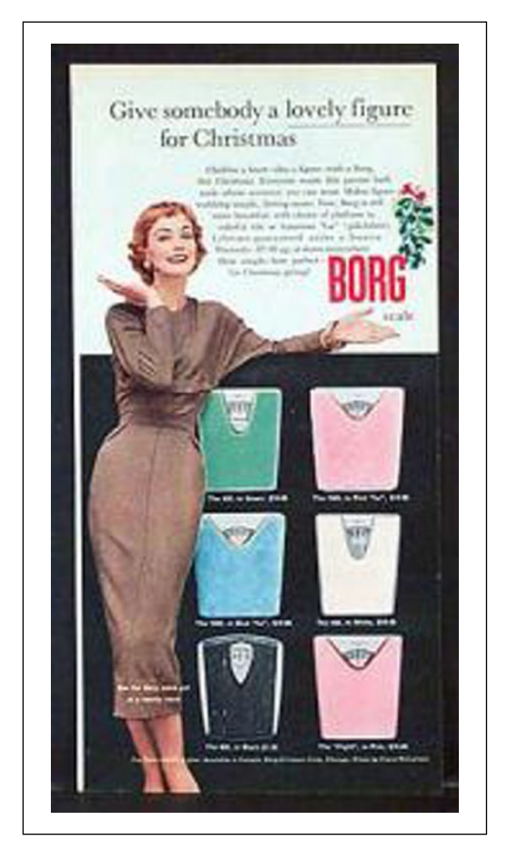
Figure 7. A holiday ad from Borg, marketing its weight scale.

wearables? Much depends on what data they use and how they define the 'normal' healthy individual, yet research on exercise, sleep, diet and health changes constantly, and this contextual 'norm-setting' data used by an analytics platform is rarely transparent.