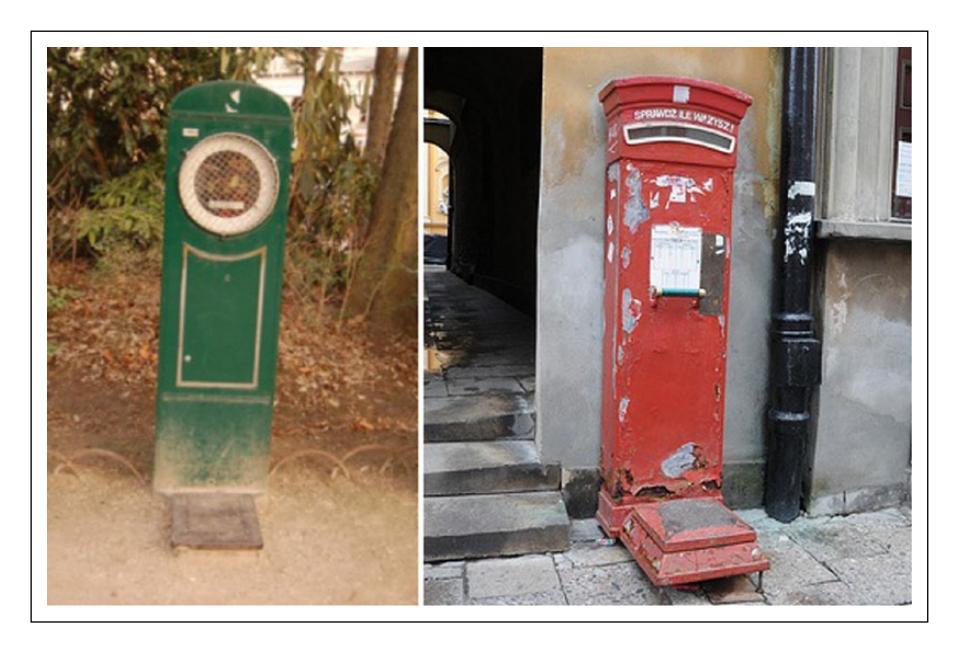
Figure 1. Public scales from the late 1880s in contemporary Paris.

emerges between the slogans used for the weight scale and the wearable: the device offers self-knowledge, and through that a new sense of control over the body, which leads to a better life.